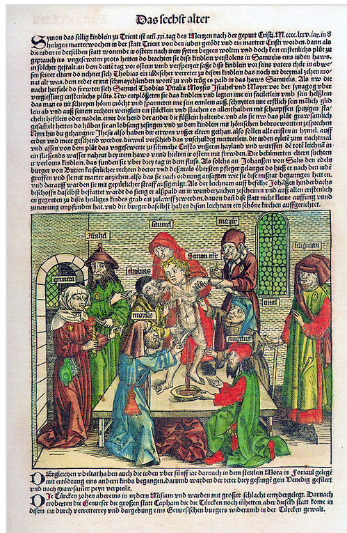
Simon of Trent blood libel. Illustration in Hartmann Schedel's Weltchronik, 1493

A student of the preacher Giovanni da Capistrano , Franciscan Bernardine of Feltre , accuses the Jews in murdering an infant, Simon . The entire community is arrested, 15 leaders are burned at the stake, the rest are expelled. In 1588, Pope Sixtus V confirmed Simon's cultus. Saint Simon was considered a martyr and patron of kidnap and torture victims for almost 500 years. In 1965, Pope Paul VI declared the episode a fraud, and decanonized Simon's sainthood.