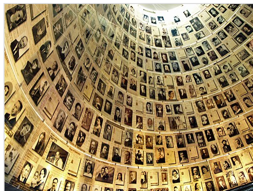
The Hall of Names in Yad Vashem contains Pages of Testimonies which commemorate the millions of Jews who were murdered during the Holocaust