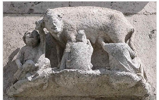
Judensau at the Cathedral of St. Peter in Regensburg ;13th century: Germany.

Appearance of Judensau : literally: Jew-sow: obscene and dehumanizing imagery of Jews suckling a sow, ranging from etchings to Cathedral ceilings. The consumption of swine, including their milk are forbidden according to Jewish law, so the insult was a double one. Its popularity lasted for over 600 years.