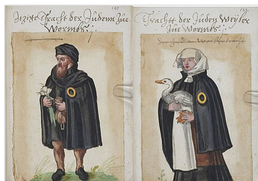
Jews from Worms, Germany wear the mandatory yellow badge . A moneybag and garlic in the hands are an antisemitic stereotype (sixteenth-century drawing).

Several Jewish scholars are burned at the stake for proselytizing in Moscow . [196]