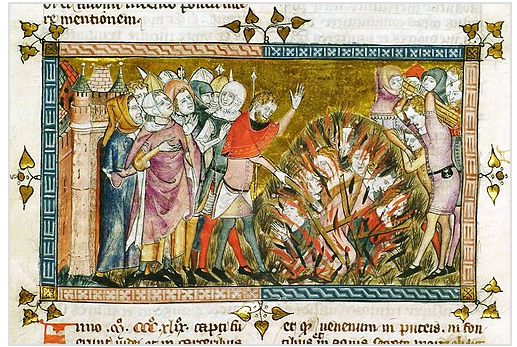
1349 burning of Jews (from a European chronicle written on the Black Death between 1349 and 1352)

The entire Jewish population of Speyer is destroyed. All Jews are either killed, converted, or fled. All their property and assets was confiscated. Part of the Black Death Jewish persecutions .