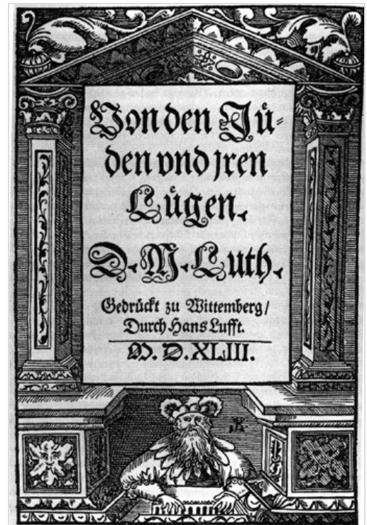
Bookcover of On the Jews and Their Lies

"...young, strong Jews and Jewesses [should]... earn their bread in the sweat of their brow..."